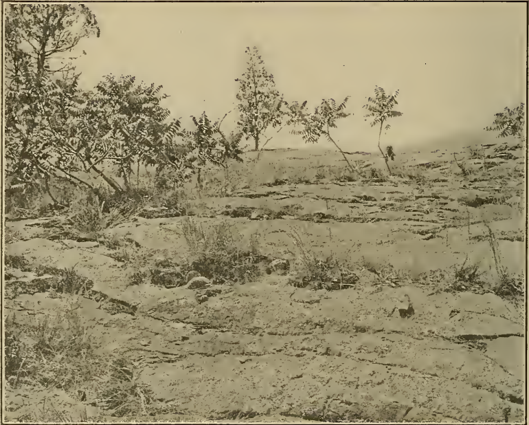
FIG. 1. Rock face and crevice vegetation on trap; near summit of West Rock, New Haven. The conspicuous lichen in the foreground is Parmelia conspersa . Among the crevice forms are Leucotryum glaucum and other mosses, Cladonia sp., Woodsia ilvensis , Andropogon scoparius , and Rhus typhina . The tree in the background is Juniperus virginiana .

for as soon as sufficient soil has accumulated they are superseded by grasses and other vascular plants. These, by means of their interlacing roots and rhizomes bind the soil together more firmly, and in this way a sod is gradually developed. Because of their omnipresence and the abundance of their tough, fibrous roots, the bunch grass ( Andropogon scoparius ) and the wire grass ( Poa compressa ) are especially important as sod formers. The wire